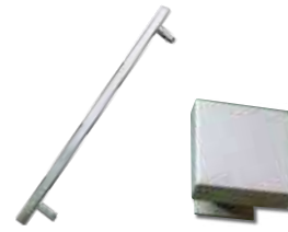
Square Bar Handle (offset)